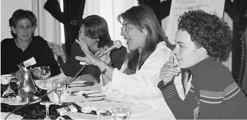
Honor Crimes was One of the Items Discussed in the Symposium on Woman, Sexuality and Social Change in the Middle East and the Mediterranean Organized by WWHR-New Ways in 2001.

to life imprisonment; hopefully these will set precedent for severe punishment of similar crimes. Despite the inadequate measures in the Penal Code, the amendments provide an initial step in overcoming the legitimization of this practice.