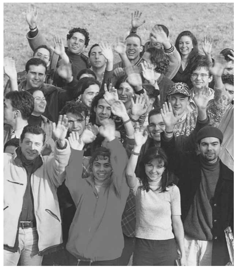
"For Years You are Taught that Sex and Sexuality is the Devil to be Feared. Then, in One Night, it is Supposed to Become the Angel to be Loved. This is Just not Possible!" (a Participant from WWHR's Human Rights Training for Women)

such circumstances as: alleged rape, sexual conduct with minors, and encouraging or acting as an intermediary for prostitution. In the case of such crimes, if there are no other means of proving the alleged crime or if the passage of time may interfere with gathering evidence for the case, the judge may order a vaginal or anal examination without the consent of the woman. The judicial decree must