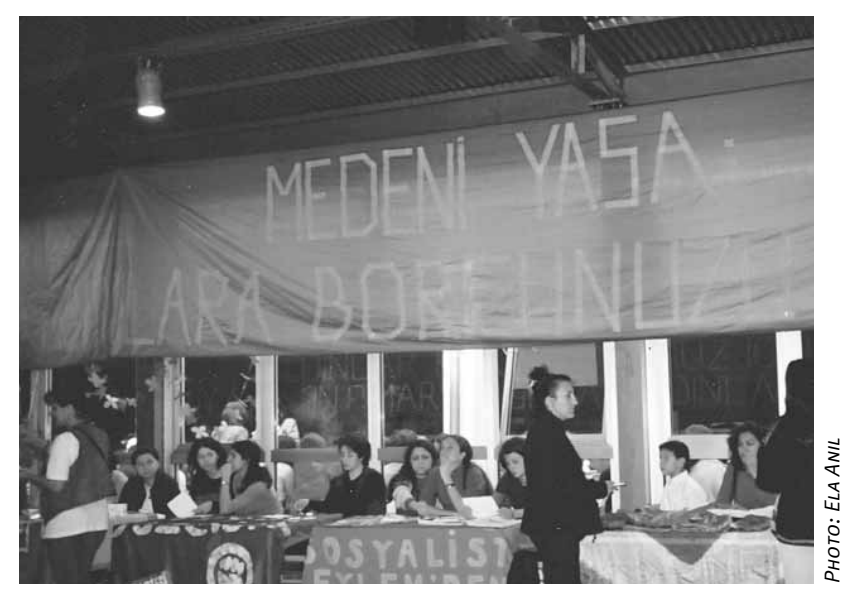
WOMEN'S FESTIVAL, MARCH 8<sup>TH</sup>, 2002. "CIVIL CODE: SETTLE YOUR DEBTS TO WOMEN."

The law specifies a minimum share of the deceased's estate, which must go to the surviving spouse, children, parents or grandparents (Article 506 of the Civil Code).