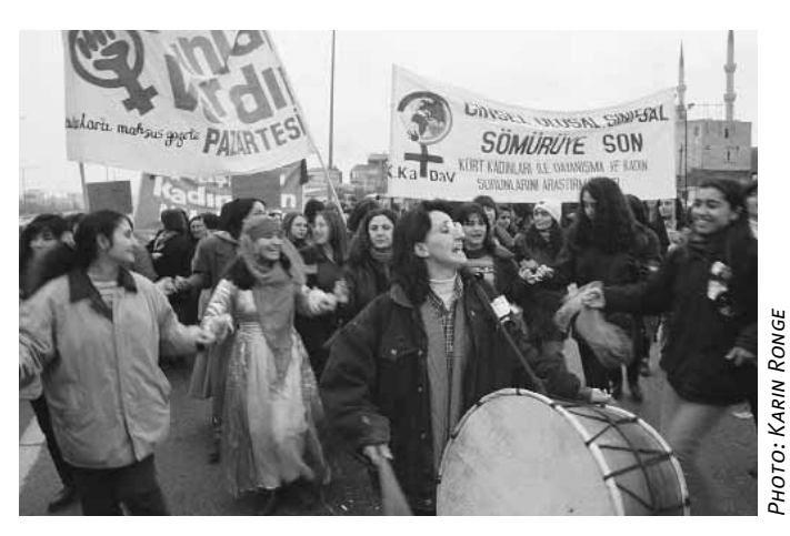
March 8<sup>TH</sup> Demonstration in Istanbul

Women for Women's Human Rights (WWHR) – NEW WAYS