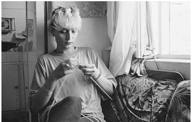
A TRANSVESTITE IN ISTANBUL.

was later removed due to the intervention of the Minister of Justice. Women's and LGBT groups are continuing to advocate for this amendment.