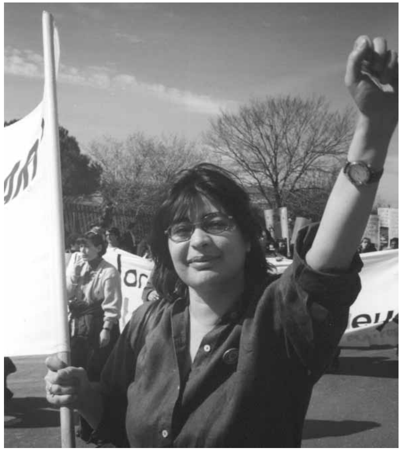
STOP VIOLENCE AGAINST WOMEN.

The Public Prosecutor can file charges at the Penal Court against a spouse who does not abide by an order. A spouse who has not abided by a protection order can be sentenced to a prison sentence of three to six months.