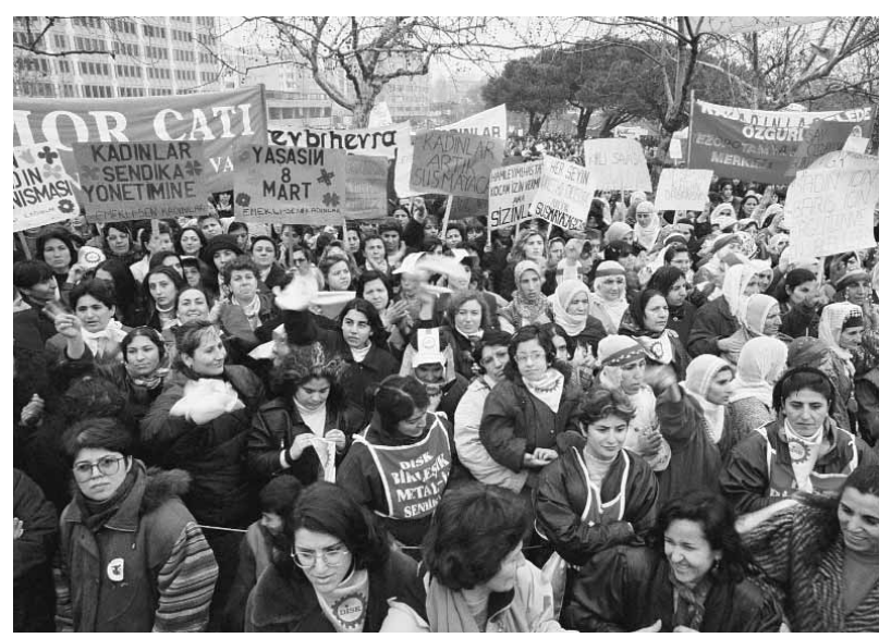
8<sup>TH</sup> of March in Istanbul

Rape: Rape and sexual assault have been regulated in Article 102 of the Penal Code entitled "Sexual Assault." While punishment for sexual assault varies from two to seven years, the prison sentence for rape can be up to 12. The crime of rape now includes the insertion of a sexual organ or object into the body.