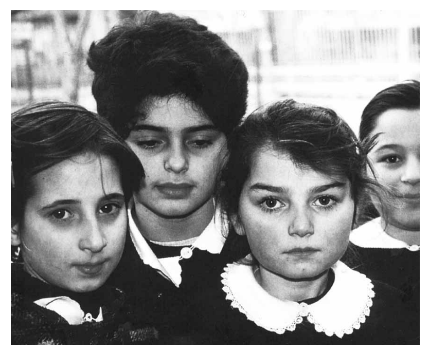
MOTHERS SHALL NOW HAVE EQUAL SAY OVER MATTERS CONCERNING THEIR CHILDREN.

Parents are responsible for providing their children with appropriate formal and religious education (Articles 340 and 341 of the Civil Code). Parents name their children, represent them in relations with third parties, educate them according to their means and also ensure and protect their physical, mental, emotional, moral and social well-being (Articles 340 and 342 of the Civil Code).