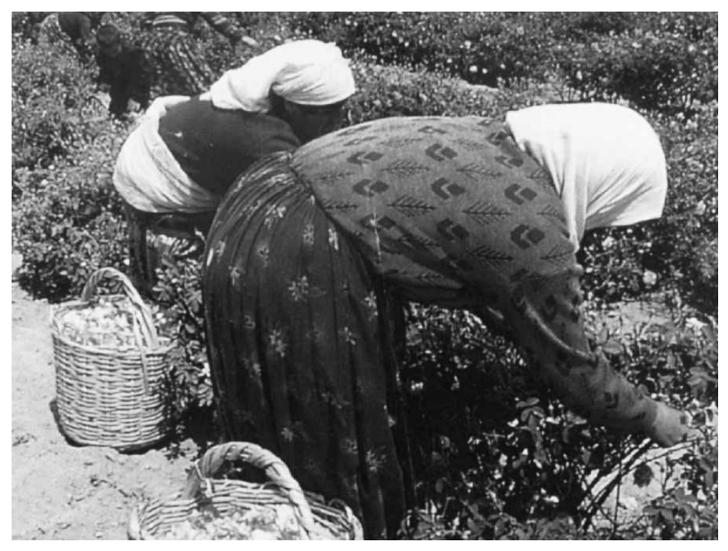
The New Civil Code Recognizes the Hitherto Invisible Labor of Women Working for Their Families.

declare their decision in writing while applying for authorization to marry.