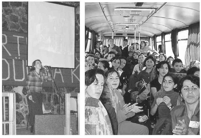
Celebrating The New Civil Code attained through Joint Action by Women's Groups.

Place of residence : With the new Civil Code, spouses jointly choose where they will live (Article 186 of the Civil Code). This is a positive change from the old clause, which assigned the decision-making power concerning place of residence to the husband. Besides, the clause that the wife's place of residence is the residence of her husband has been deleted from the definition of legal domicile. Under Turkish law spouses have to live together (Article 185 of the Civil Code).